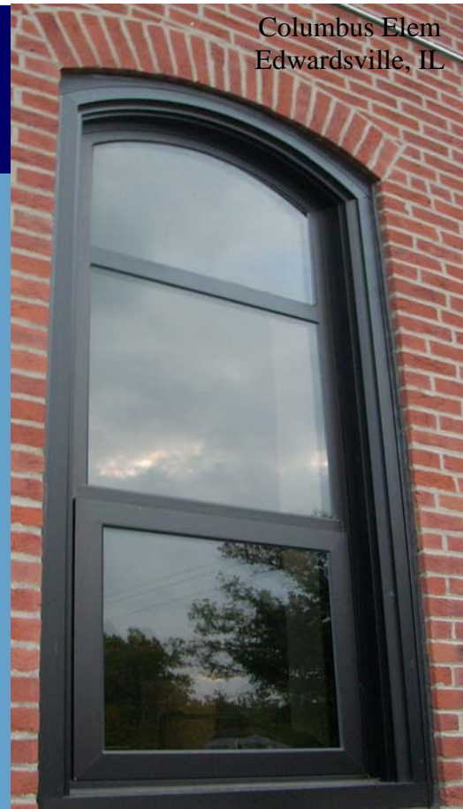
Columbus Elem Edwardsville, IL