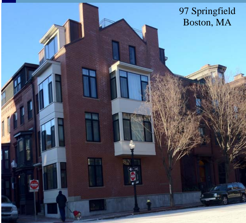
97 Springfield Boston, MA